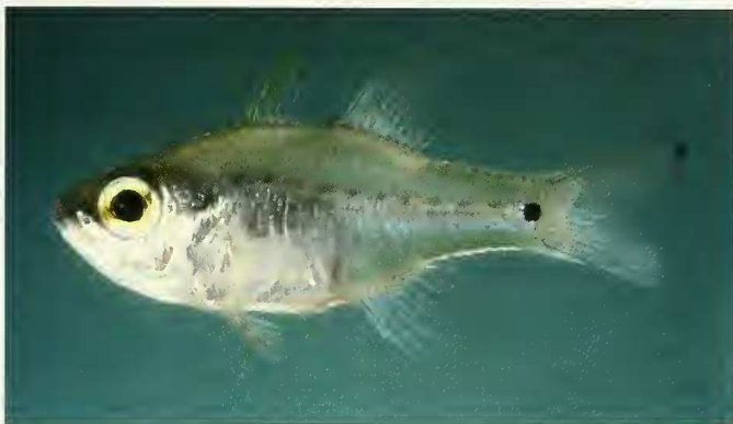
Figure 4. Holotype of Zorania viridiventer , BPBM 32507.

Color of holotype in alcohol pale yellowish on head and body, a little dusky dorsally on nape, along base of dorsal fins, and dorsally on caudal peduncle; a roundish black spot posteriorly on caudal peduncle slightly more than half pupil diameter in size; scattered melanophores on posterior half of caudal peduncle but